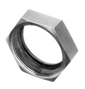
No. 13 Clamp Used with CSI, CST, and CSQ Seals